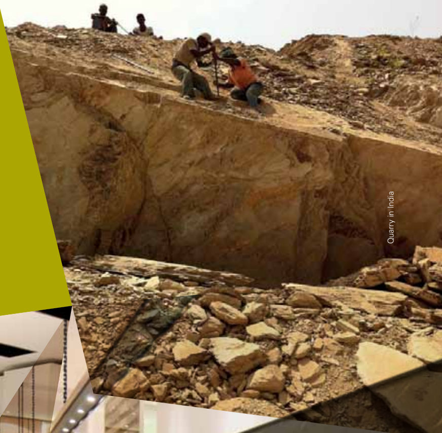
Quarry in India

Like slate, SLATE LITE's high-wear resistance and chemical composition make it ideal for commercial and residential environments.